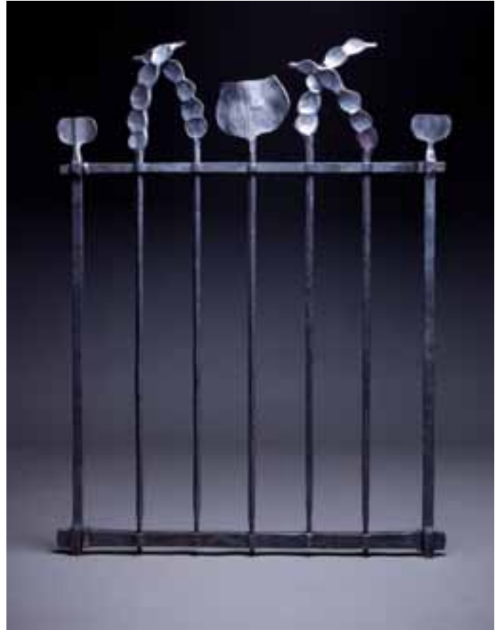
This gate has been installed at 1315 Winnie, alley-side.

wide and 4" tall. It's as close to magic as I'm going to get!